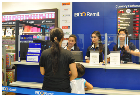
A prospective client inquires at BDO Remit Counter located at the second floor of SM Olongapo Department Store.